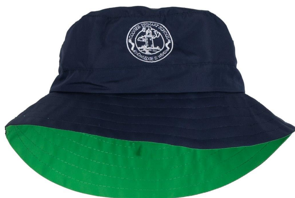
4 - Bucket Hat