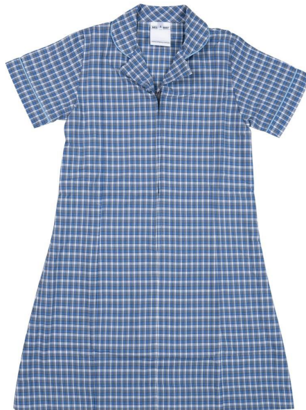
2 - Check Dress