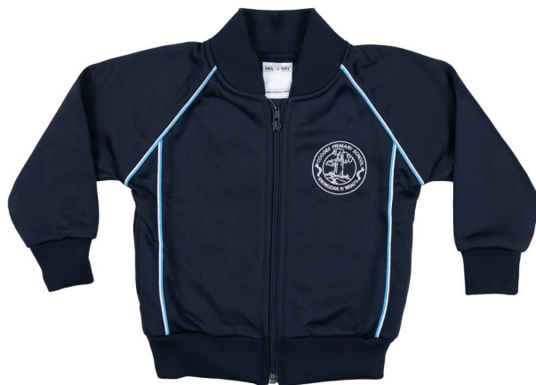
3 - Jacket (fleecy)