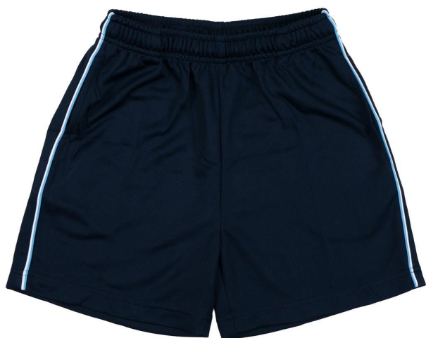
5 - Shorts (unisex)