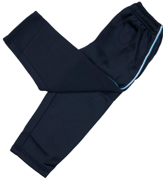
7 - Trackpants (fleecy)