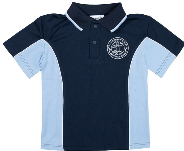
1 - Polo Top