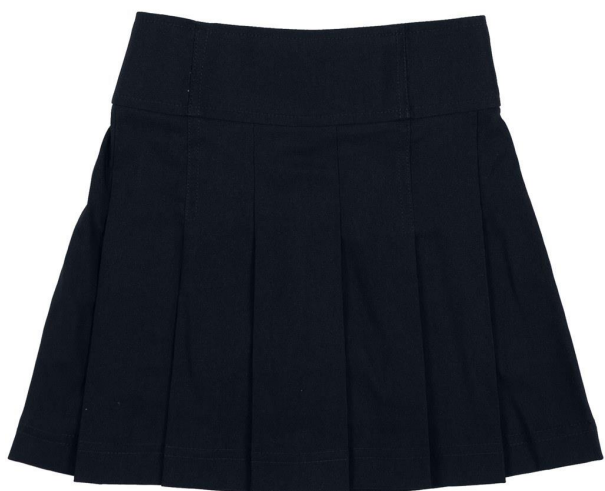
6 - Zina skirt (skort)