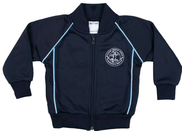
3 - Jacket (fleecy)