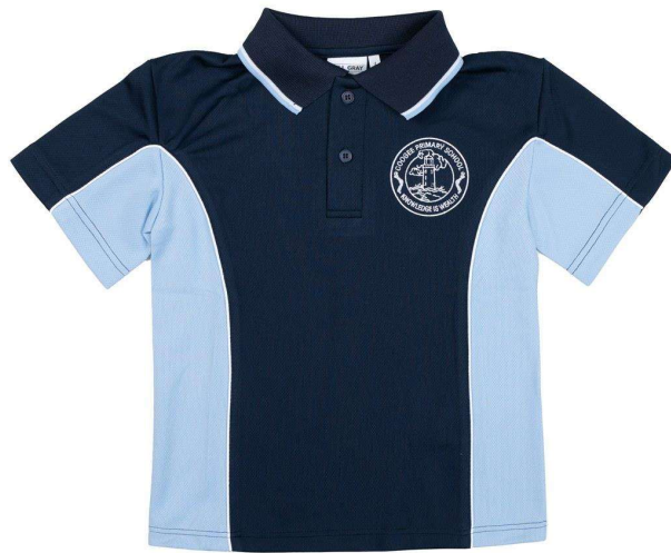
1 - Polo Top