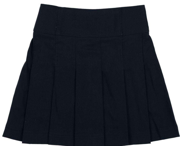
6 - Zina skirt (skort)