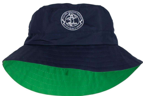
4 - Bucket Hat