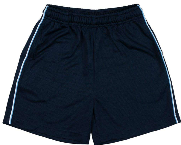
5 - Shorts (unisex)